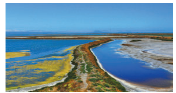
Hiking and biking trails lead out of Coyote Hills Regional Park into wildlife refuge marshes of San Francisco Bay. The park and the adjoining marshes are stopovers for migratory waterfowl and shorebirds on the Pacific Flyway.

Visitors are responsible for knowing and complying with park rules (Ordinance 38). See www.ebparks.org/rules .